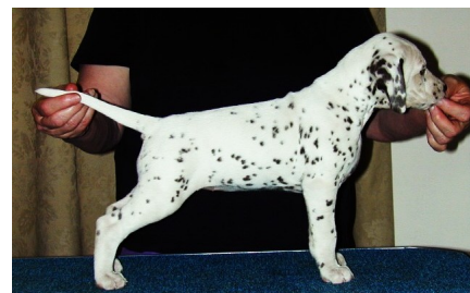
A beautiful young Dal bitch that is also LUA

In some ways, DCA’s continued inability to come to terms with the